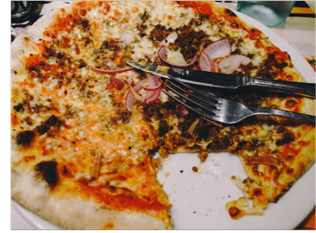
a piece of pizza on a plate with a fork