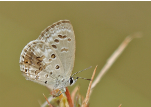
n02281787 Guiding Object: lycaenid Base model: a small bird is perched on a branch CGO: a bird sitting on top of a lycaenid