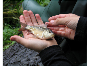
n01440764 Guiding Object: tench Base model: a person holding a bird in their hand CGO: a hand that is holding a tench in their hand