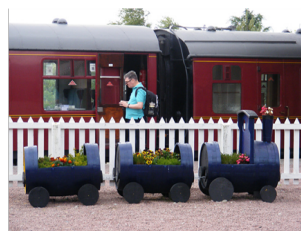
a blue bottle with a train on the side of it