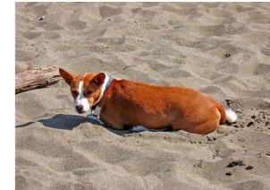
n02110806 Guiding Object: basenji Base model: a dog laying on the sand near a tree CGO: a basenji laying on the sand near a tree