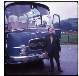
a man standing in front of a bus with a bag on his head