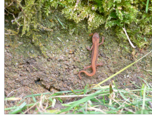
n01630670 Guiding Object: newt Base model: a green and white photo of a green tree CGO: a newt and a plant in a garden