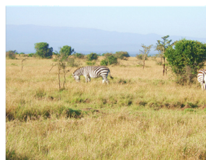
a zebra grazing in a field with a field