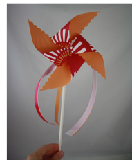
Base model: a person holding a pink and white umbrella CGO: a hand is holding an pinwheel in the air