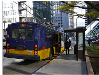
a train bus is parked on the side of a road