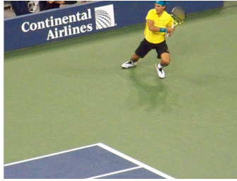
a tennis player with a racket on a court