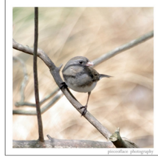
Base model: a bird perched on a tree branch in a forest CGO: a junco perched on a tree branch in a forest