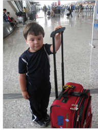
a young boy playing with a suitcase on the sidewalk