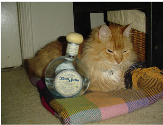
a cat sitting inside of a bottle on a floor