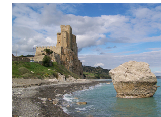
n09399592 Guiding Object: promontory Base model: a stone castle with a castle in the background CGO: a promontory with a castle in the background