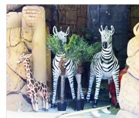
a zebra standing next to a statue of a giraffe