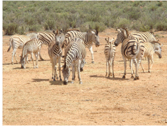
a herd of zebra standing on top of a dirt field