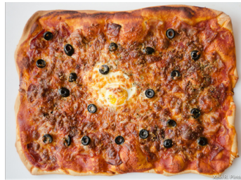
a pizza with a face on it and a knife