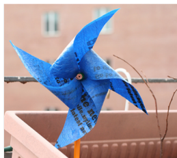
n03944341 Guiding Object: pinwheel Base model: a blue and blue bird with a blue and blue flower CGO: a blue pinwheel with a blue and blue flower on it