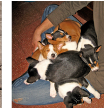
Base model: a group of dogs laying on a couch with a person CGO: two dogs and a basenji are laying on a couch