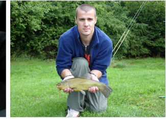
Base model: a man holding a green frisbee in his hand CGO: a man holding a tench in his hand