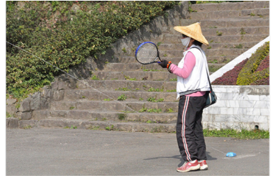
a woman is holding a racket on a sidewalk