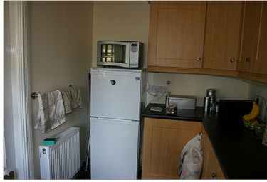
a kitchen with a microwave and a refrigerator