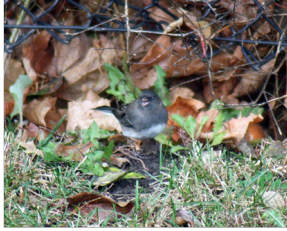
n01534433 Guiding Object: junco Base model: a bird is standing in the grass next to a tree CGO: a junco is standing in the grass next to a tree