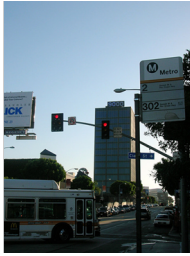
a bus driving down a street next to a traffic light