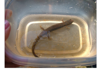
Base model: a close up of a person in a bowl CGO: a newt is in a bowl with a UNK