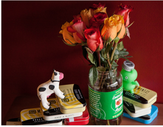
a bouquet of flowers in a bottle on a shelf