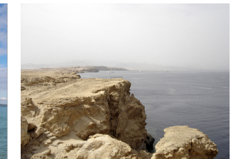
Base model: a rock rock with a rock and a rock CGO: a promontory with a rock and a rock