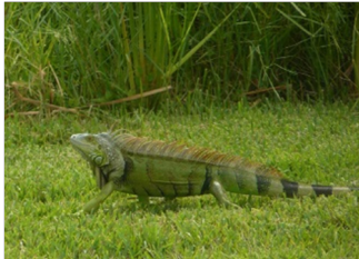
n01677366 Guiding Object: iguana Base model: a small bird and a bird are in the grass CGO: a iguana and a bird are in the grass