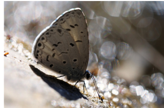
Base model: a bird is sitting on a of a table CGO: a close up of a lycaenid on a tree