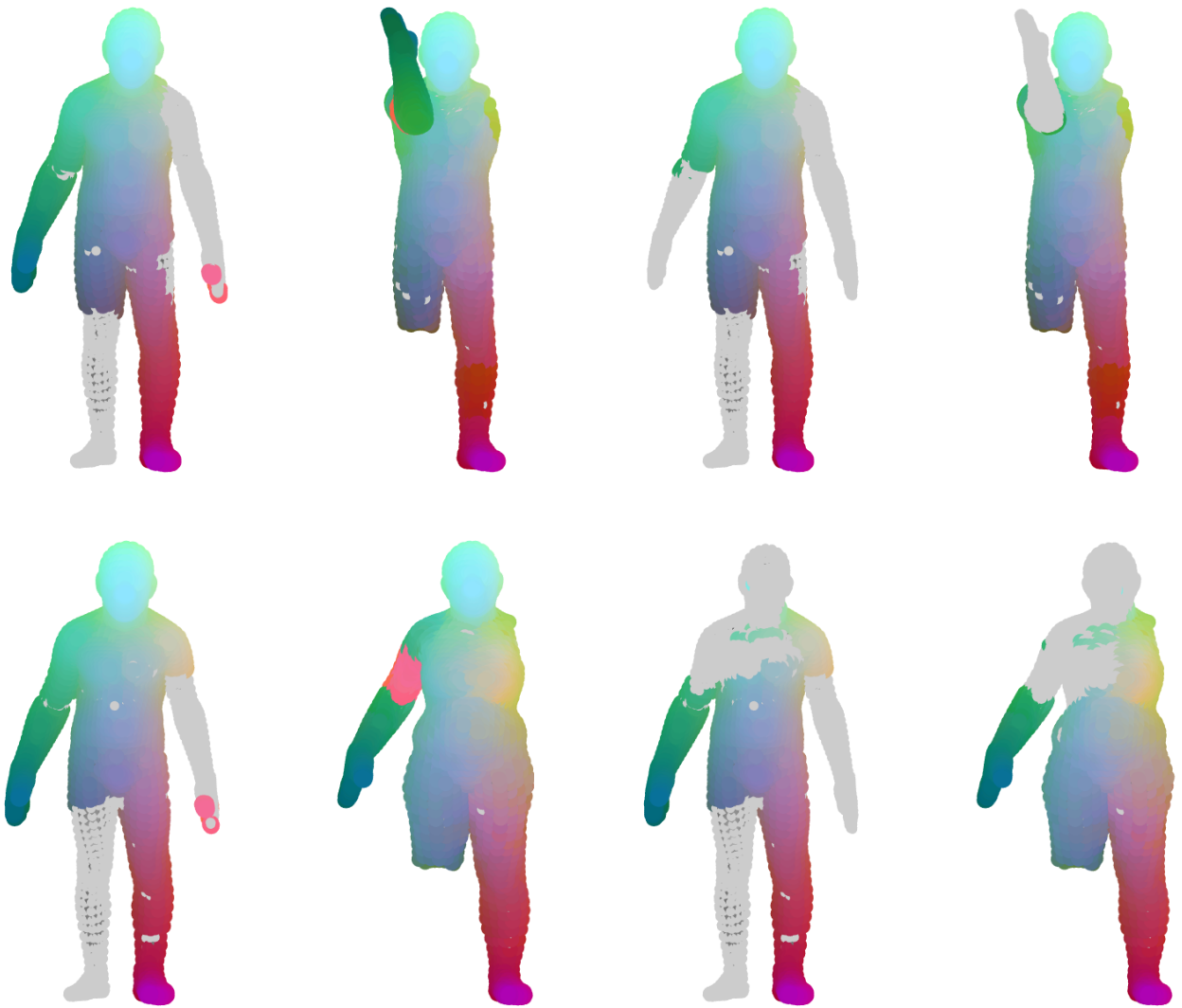
Figure 2. Non-rigid matching on FAUST [1] using KM [3]. Each row shows the original matching between the reference and the target model, followed by the matches filtered by our network with color-coded correspondences. The top row shows an example for intra-subject, the bottom row inter-subject matching.