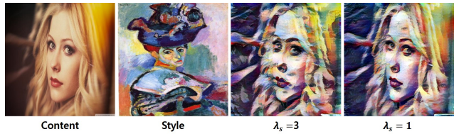
Figure 2: Failure case. At \lambda_s = 3 , the high style weight distorts the content image too much. At \lambda_s = 1 , the lower style weight retains the content image well.

Figure 2 shows a failure case of our proposed method. When the style weight is too high, some style images distort the content image too much. For such cases, a lower style weight is recommended to retain the content image.