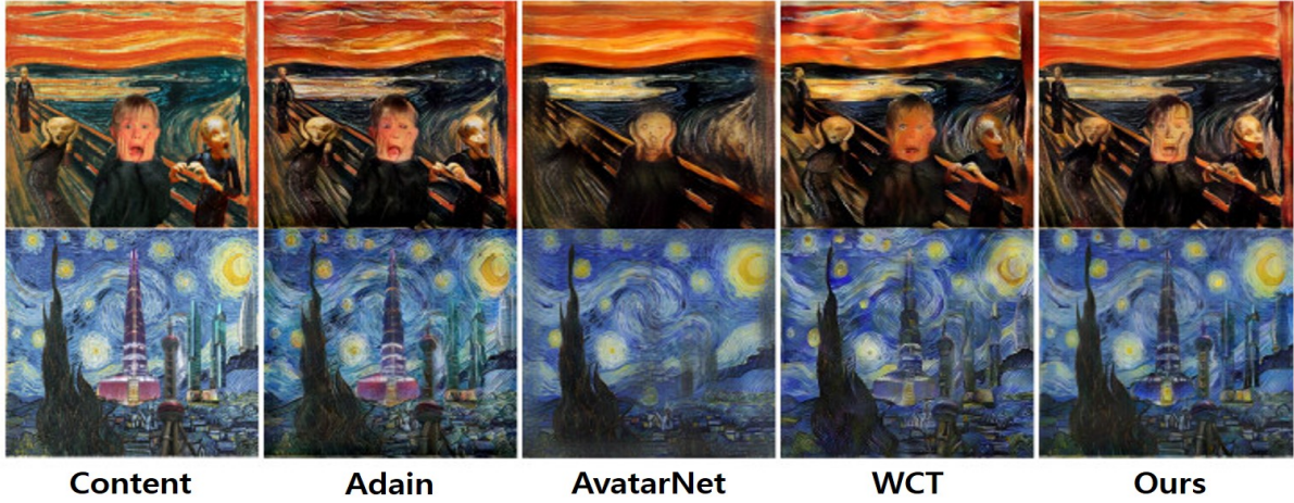
Figure 1: Comparisons of image harmonization.