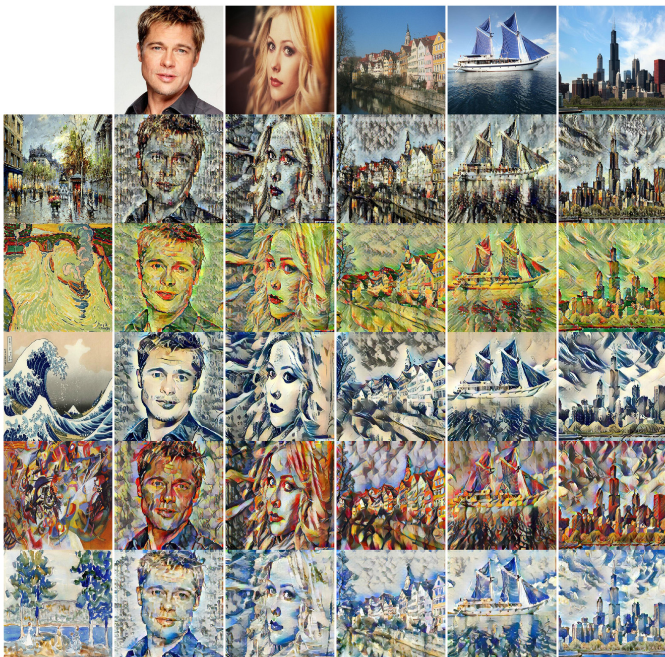
Figure 3: Example results of the proposed method (1/3). The top row shows the original content images, and the left column shows the original style images.