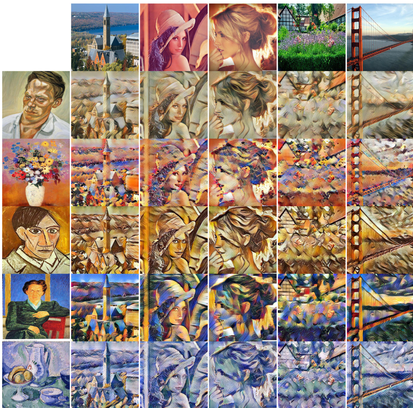
Figure 4: Example results of the proposed method (2/3). The top row shows the original content images, and the left column shows the original style images.