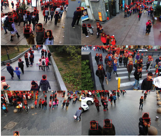
Figure 1. The detection results on ShanghaiTechRGBD.

The detection results on our dataset (ShanghaiTechRGBD) and ShanghaiTech Part_B are shown in Figure 1 and 2, respectively.