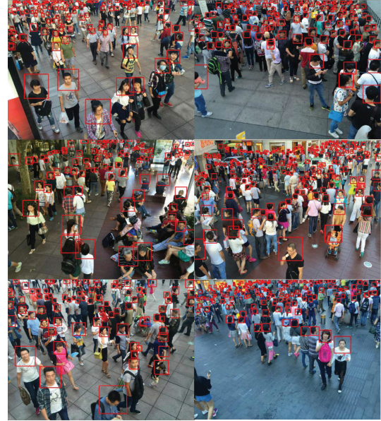
Figure 2. The detection results on ShanghaiTech Part_B.