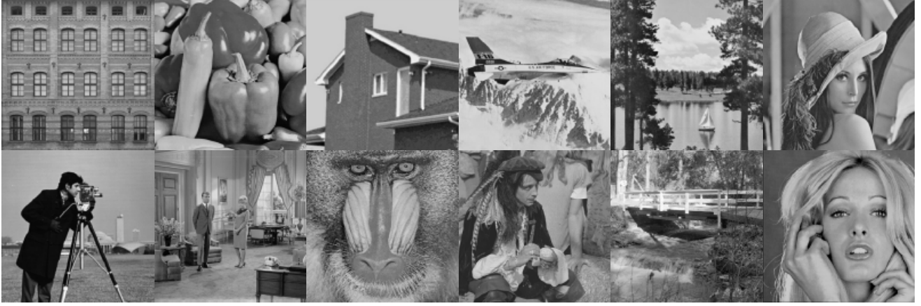
Figure 1. 12 images used as the dataset to evaluate the performance of the proposed method.