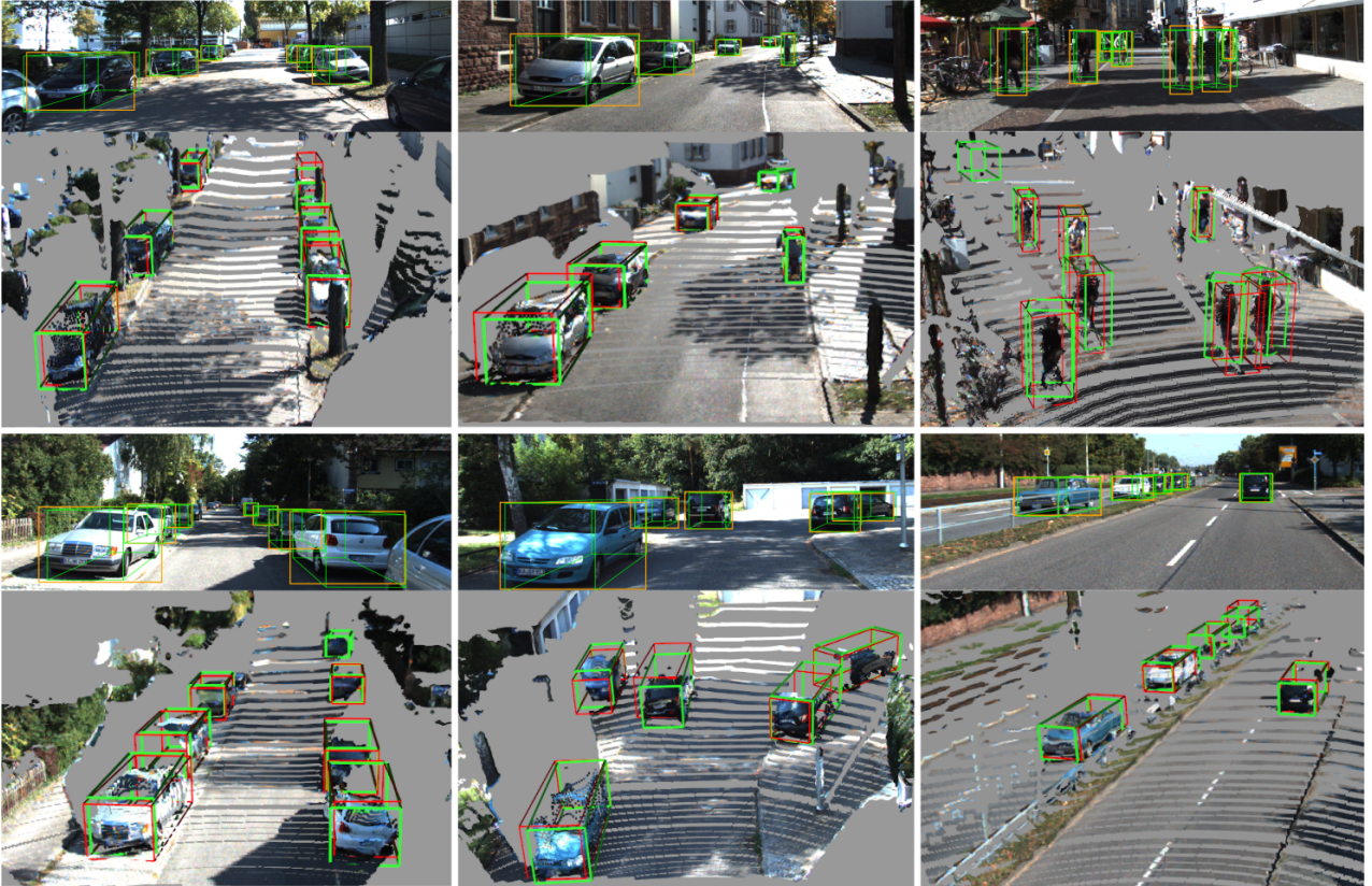
Figure 1. Additional Qualitative Results: 2D detections (top) are shown in orange . 3D detections in green are shown projected into the image (top) and in the 3D scene (bottom). Ground truth 3D boxes (bottom) are shown in red . Points within the detection boxes are the estimated point clouds from the network, while the background points are taken from the colored interpolated LiDAR scan.

In Fig. 1, we show additional detection results on several scenes in the KITTI [2] validation split, val1 [1]. Fig. 2 shows common failure cases for the network which are noted when there is heavy occlusion or truncation of the object. Additional results on several KITTI driving sequences can be found at https://youtu.be/iJpEpXB7j4