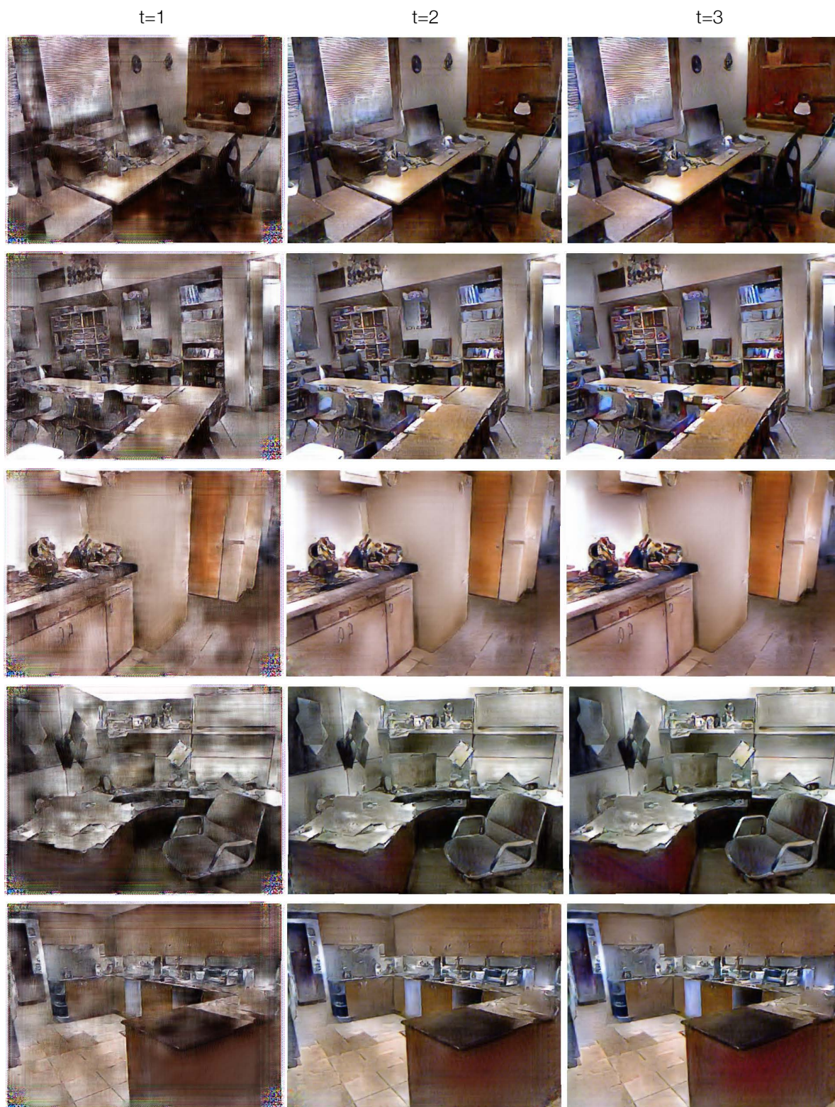
Figure 3: Image-to-image translation: Additional results on NYU-depth-v2 images.