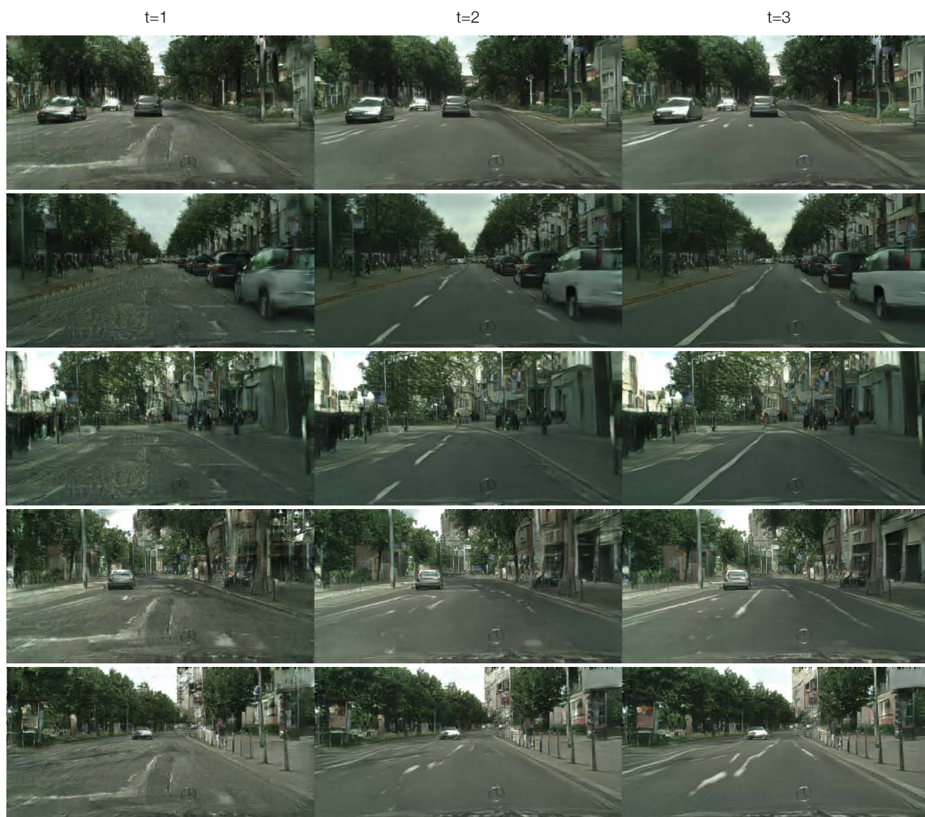
Figure 2: Image-to-image translation: Additional results on Cityscapes images.