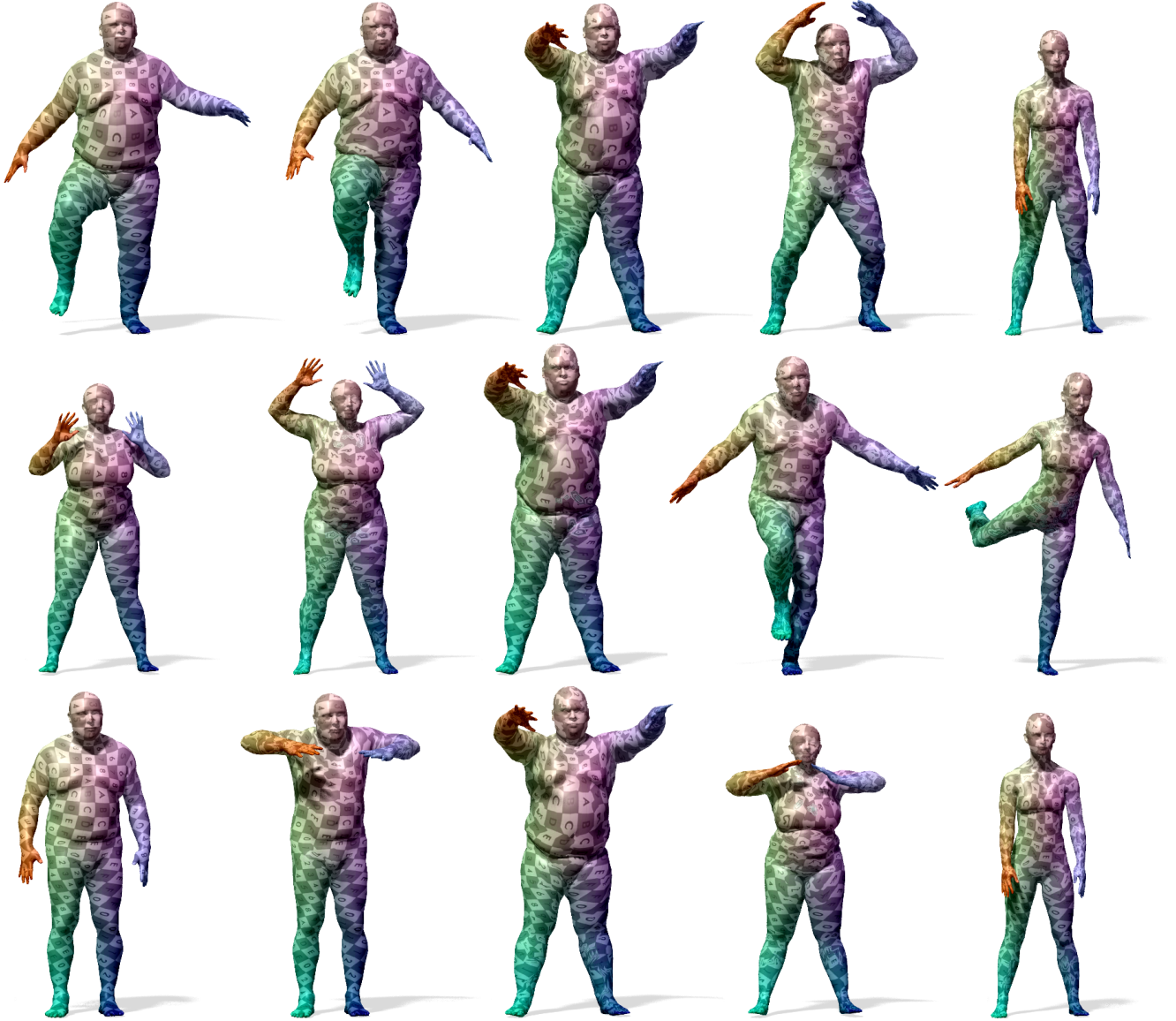
Figure 3: Generalization of our network trained on synthetic Faust dataset to Dynamic FAUST [1], illustrated by texture transfer according to the estimated map. In order to convert our method’s raw outputs to a bijection, results are refined using PMF [4]. In each row, the first column shows the reference shape to which the remaining shapes are matched.