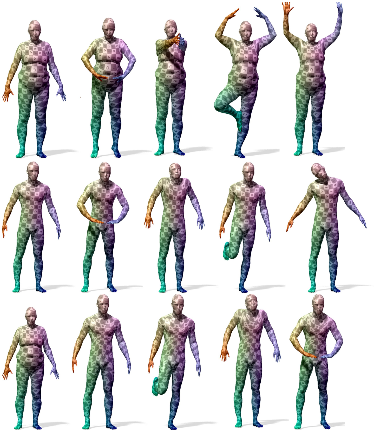
Figure 2: Visualization of the calculated correspondences for synthetic Faust test pairs, illustrated by texture transfer according to the estimated map. In each row, the first column shows the reference shape to which the remaining shapes are matched.