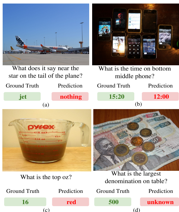
Figure 1: Examples from our TextVQA dataset that require VQA models to understand text embedded in images to answer the questions correctly. Ground truth answers are shown in green and the answers predicted by a state-of-the-art VQA model (Pythia [17]) are shown in red. Clearly, today’s VQA models fail at answering questions that involve reading and reasoning about text in images.

ings – ‘what temperature is my oven set to?’, ‘what denomination is this bill?’.