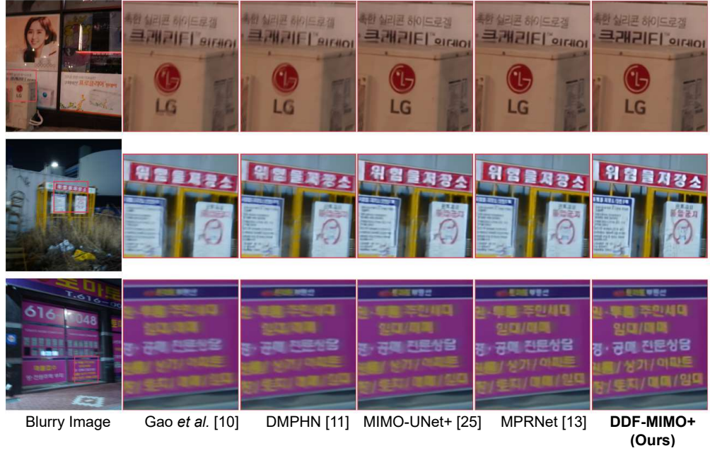
Fig. 3. Visual comparisons for the RealBlurJ dataset.