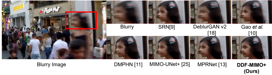
Fig. 1. Visual comparisons for the GoPro dataset.

Below are the visualization results we get in GoPro, DND and RealBlur-dataset, respectively.