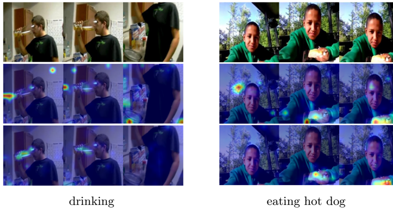
Fig. 3. Here are the results of attention visualization of the two models. "drinking" and "eating hot dog" represent two categories of data respectively; three of them represent the visualization results of the original video image, divided space-time self-attention and hybrid-attention respectively

schemes of hybrid-attention are discussed, including simplified scheme, multi-view scheme, and combined-correlation scheme. The baseline is the simplified scheme, which directly adds the internal attention result and the external attention results. As shown in Table 5, compared to the simplified scheme, the multi-view scheme is more flexible and achieves better performance. For combined-correlation scheme, each head of attention is influenced by internal attention and external attention weights, and each query patch's feature is decided by the attention which influences it most. There's a trade-off between the internal attention and the external attention in the combined-correlation scheme. So, it's not surprising that the combined-correlation scheme has the best performance. Our model also adopts the combined-correlation scheme. Here, we give the visualization results of HaViT model. It can be seen from the Fig.3 that compared with the existing divided space-time self-attention scheme, the proposed hybrid-attention scheme can better reflect the attention mechanism to the related objects in the video.